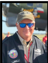
From the Left Seat