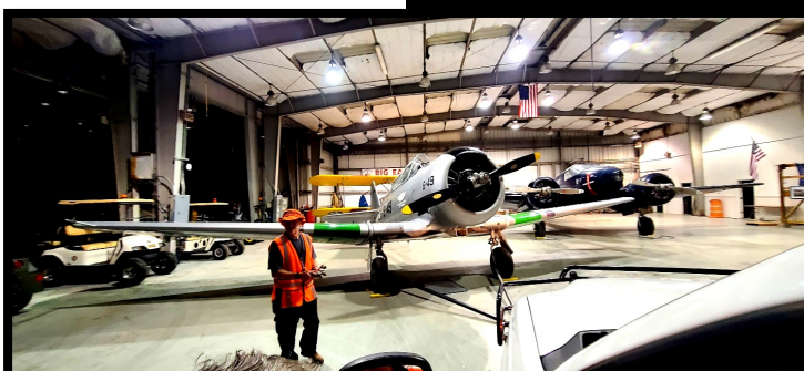
Stack them in, Stack them in!