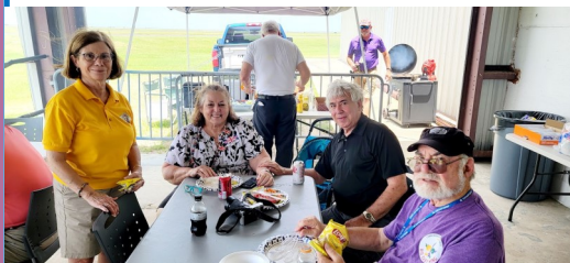
British Car club members