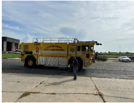
Fire Truck Ride

We held our second Kaydet Training Course for Boy Scout Aviation merit badge on July 20, 2024. In attendance were 6 scouts from Troop 18 in Westwego, LA. It was a fun day with a group of very attentive scouts. There was a surprise extra activity when the airport Fire Engine pulled up and offered rides to the students. They held the “jaws of life” and I heard it was a blast to get to shoot the water cannon on the Fire Truck.