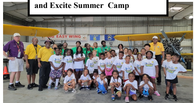
New Orleans Golden Eagle (NOGE) and Excite Summer Camp