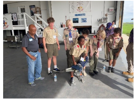
The Jaws of Life