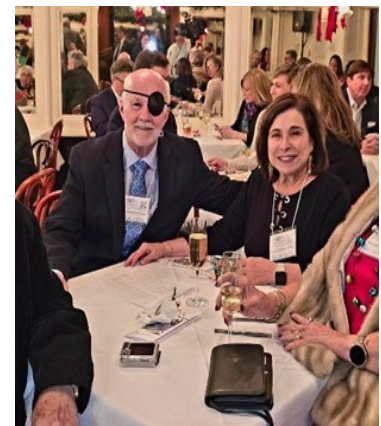
We both wonder... where's the food?

Please see Shirley's rides article about our education class we have scheduled for January.